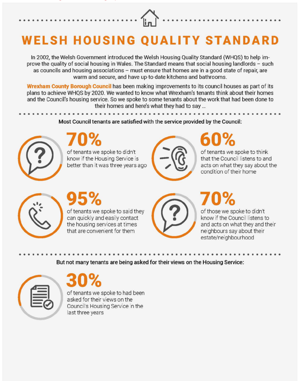
Exhibit 2: housing service infographic