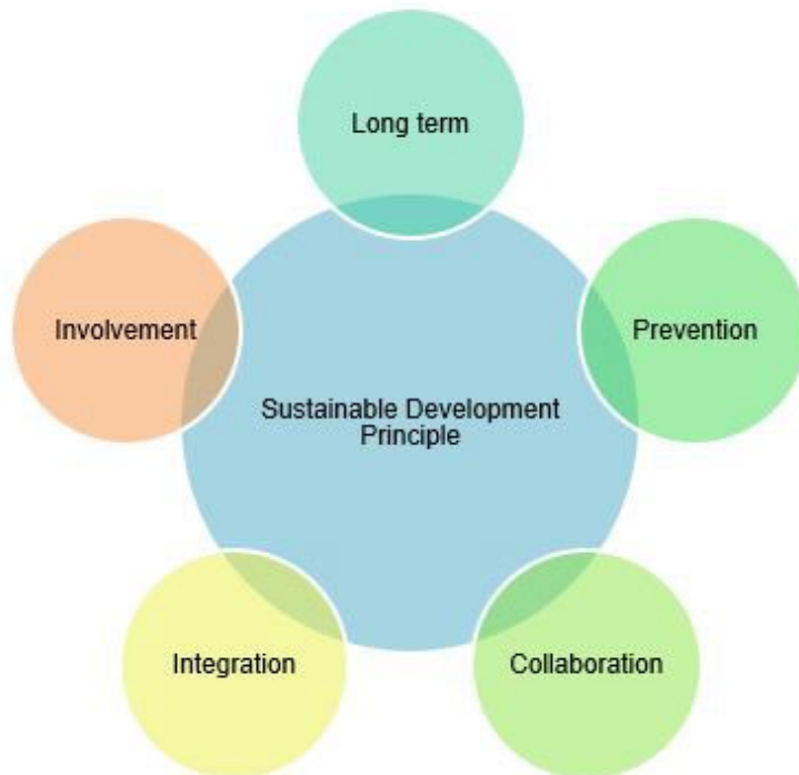
Exhibit 1: the sustainable development principle and the five ways of working