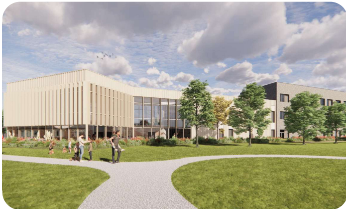
Planned future Ely/ Parkview Health & Wellbeing Hub Partnership Project.

A pipeline of future joint partnership hubs are planned which recognises the importance of close partnership working to deliver on our shared aspirations for joined up Health and Social care services.