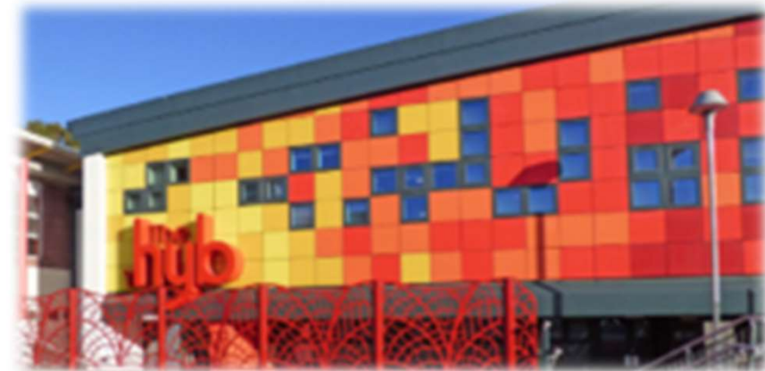
Health and Wellbeing Hub in Llanedeyrn

Our 'virtual' Hub, hosts information and online events.