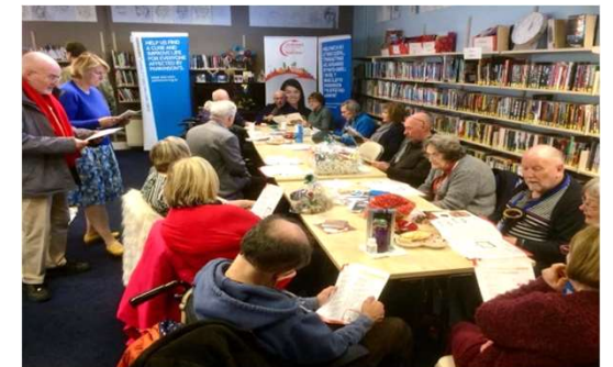
Parkinson's Café, Rhydpennau Hub