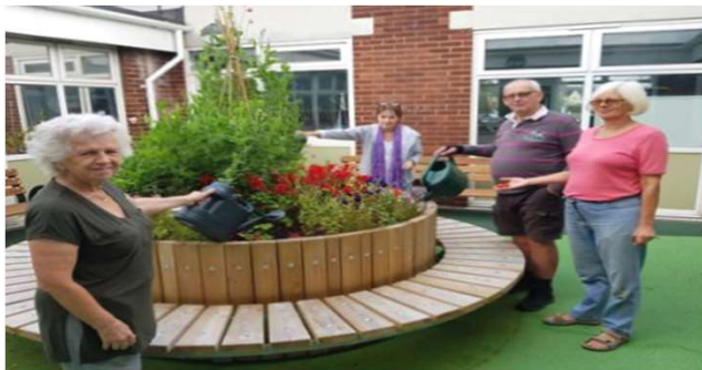
Gardening group, Llandaff North Hub

New community rooms provide venues for partners to deliver a wide range of physical activities and other opportunities for older people to stay fit alongside a range of social activities to prevent isolation and loneliness.