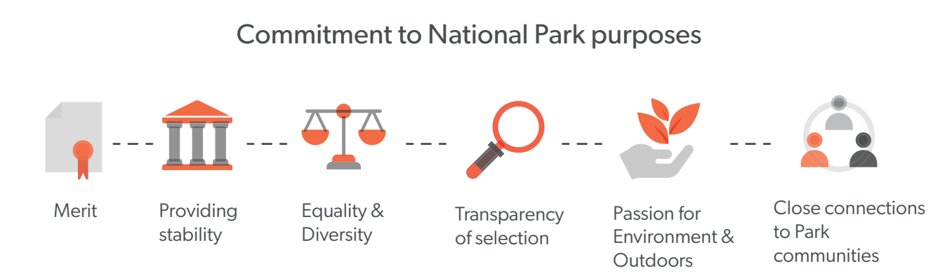
Exhibit 8: key considerations for local authorities when nominating councillors to sit on National Park Authorities, as set out in the protocol