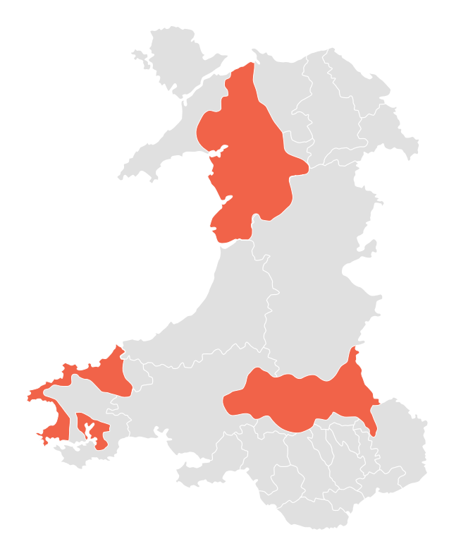
Exhibit 2: national parks of Wales